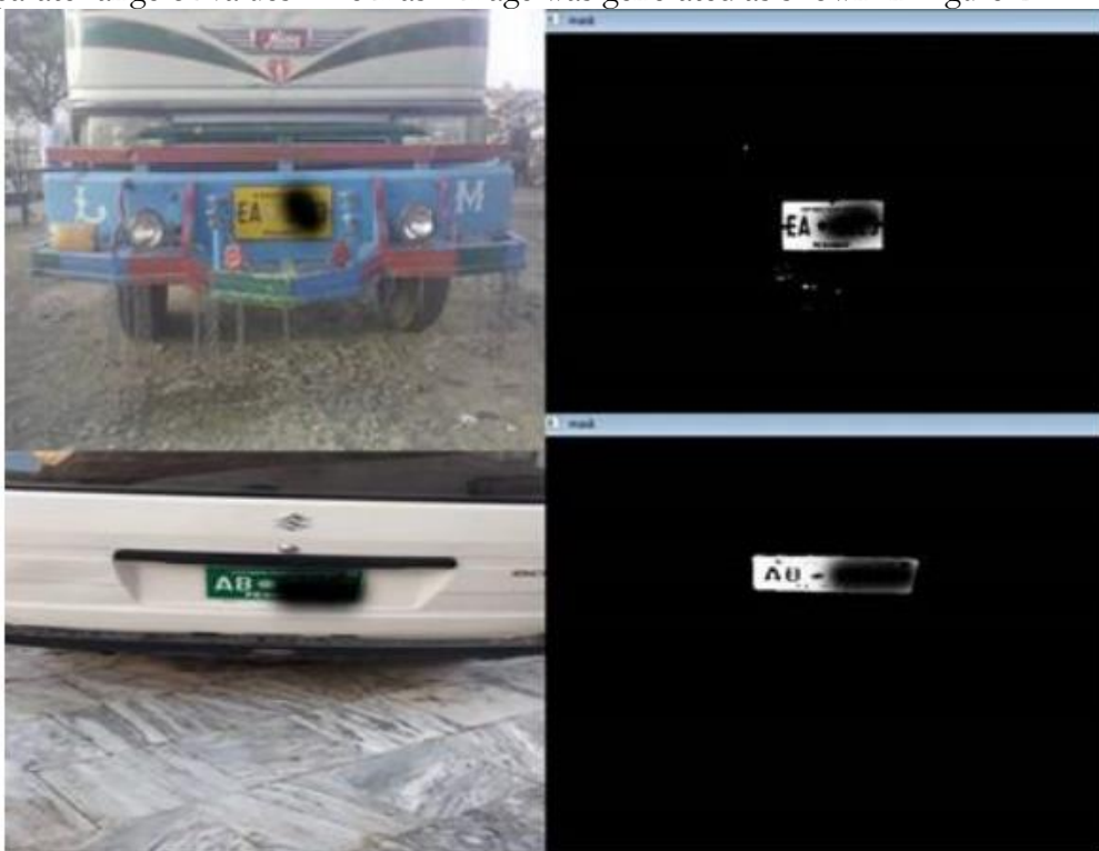
Figure 2. (a) Input image with yellow plate, (b) Mask image, (c) Input Image with green Plate and (d) Mask image

The input image was resized and pre-processing techniques were used to enhance the quality of the input image. It was then converted from RGB color format to HSV color format to easily filter the desired color intensity using a NumPy array of lower and upper bound values. Separate lower and upper bound values were used for each NP's color detection because each color had a separate range of values. The mask image was generated as shown in Figure. 2.