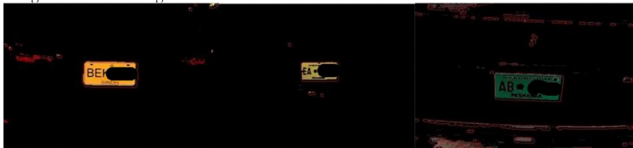
Figure 3. Shows some sample images after finding contours To increase the accuracy rate we used shape approximation in the second phase to overcome the problems that shown in Figure 4

The proposed method is based on color intensities with shape approximation. Due to the prominent colors used in our country for NPs it becomes easy to detect the ROI easily using color based segmentation and in more than 80% cases, the plates using their color intensities are easily distinguished shown in Figure 3.