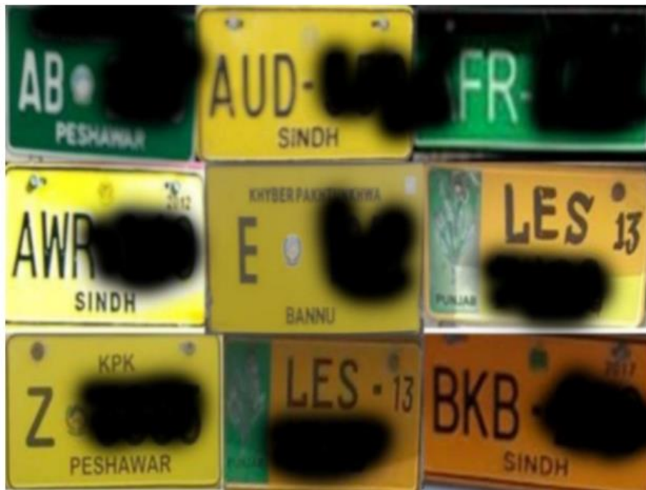
Figure 5. Sample Images of NP

color is used in Khyber Pakhtunkhwa and Sindh provinces; green-yellow is used in Punjab and Baluchistan provinces. Sample images of Number Plates used in our country are shown in Figure. 5.