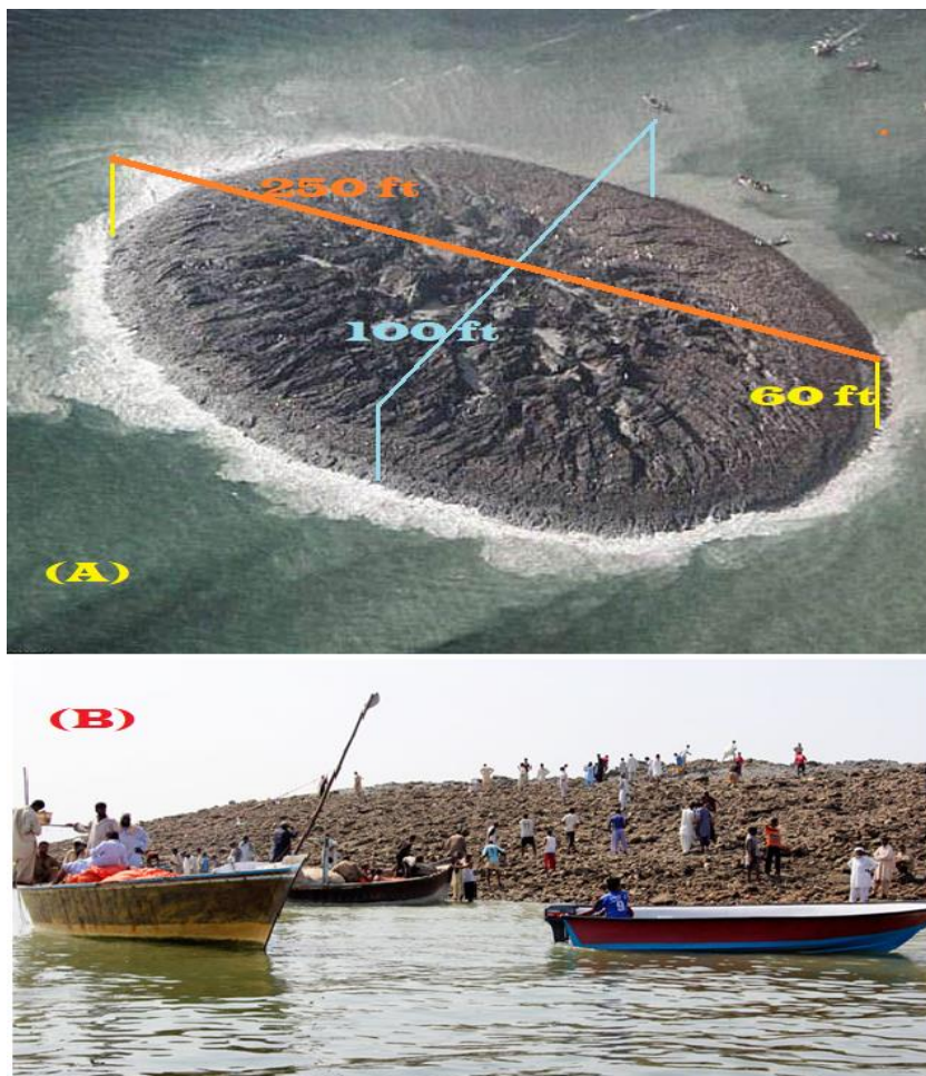
Figure 2. A) Newly born Island captured by NASA and B) People visiting this island.

We downloaded the satellite image of Landsat 8 from earth explorer website of various dates as mentioned in Table 1,