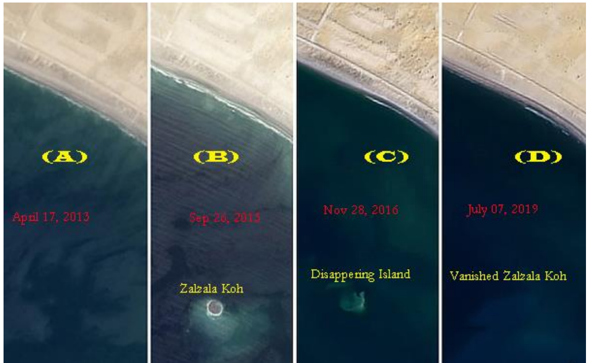
Figure 3. Spatio-temporal changes from birth to vanishing of Zalzal Koh.

The results of supervised classification are shown in Figure 3. A part of figure 3 is showing that there exists no island near to coastline because this image was captured as pre-earthquake. The B part of this figure is showing that a new island has emerged which has named a Zalzal-Koh. Figure 3(C) is showing that the island has slightly disappeared and its volume has declined to much extent. Figure 3(D) is showing that the newly born island has completely vanished.