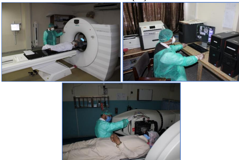
Figure 1. Radiotherapy Technologists wearing PPEs and working on CT simulator (Left), CT simulator console (Middle) and Cobalt-60 teletherapy machine (Right).

During Covid pandemic, All the employees were provided with optimal Personal Protective Equipment (PPEs) free of cost based on their exposure to the patients and general public., PPEs included masks, gowns, head covers, gloves and shoe covers. It was mandatory to use double masks (inner non-medical cloth mask with outer N95 respirator) for the employees directly dealing and handling the patients. Whereas wearing inner fabric mask with outer medical (surgical) mask was compulsory for all other workers working in close proximity to co-workers and clients. Special lectures were arranged for INOR employees on WHO recommendation of how and when to use masks [17].