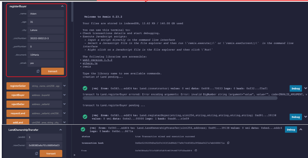
Fig. 3. Demonstration of the proposed system