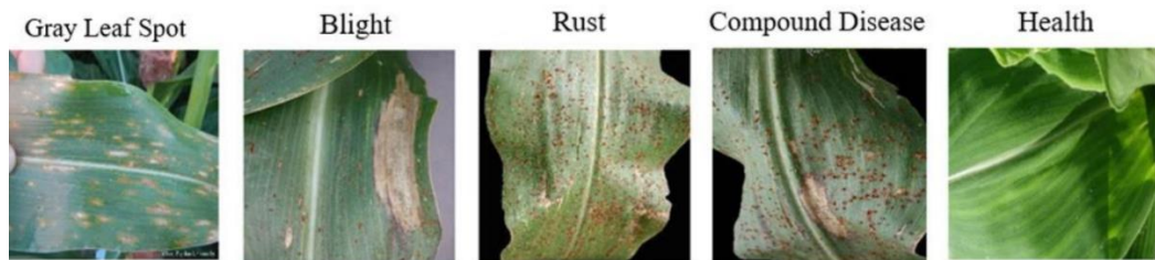
Figure 1: Illustration of different disease lesions on maize leaves [16].

create artificial training data for bacterial spot disease. The results demonstrated that the third training dataset generated by DC-GAN outperformed the original dataset, emphasizing the potential of generative adversarial networks in enhancing object recognition model training with limited data.